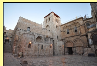
Church of the Holy Sepulchre