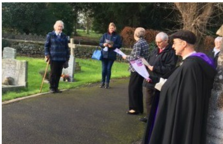
Carols in the churchyard