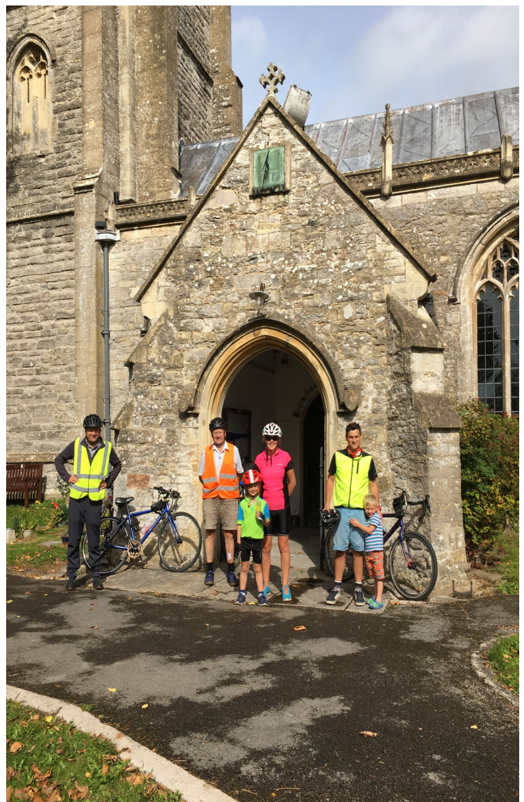
2020 Ride and Stride Event