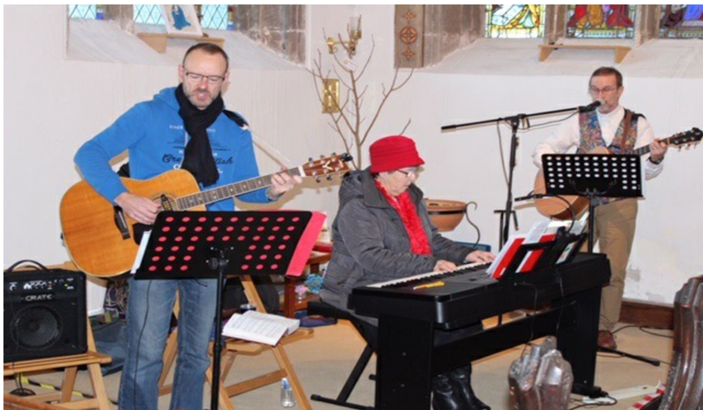
Café Church—before Lockdown

Income to the Heritage Fund is generously supported through fund raising activities across the Parish. Each church building has a small fundraising team who work extremely hard to ensure the buildings can be retained at the heart of our communities. Regrettably, due the COVID-19 virus very little activity was possible during 2020. All three fundraising teams did carry out one activity in December and the results are shown on the attached figures, although some of the receipts were not banked until January 2021.