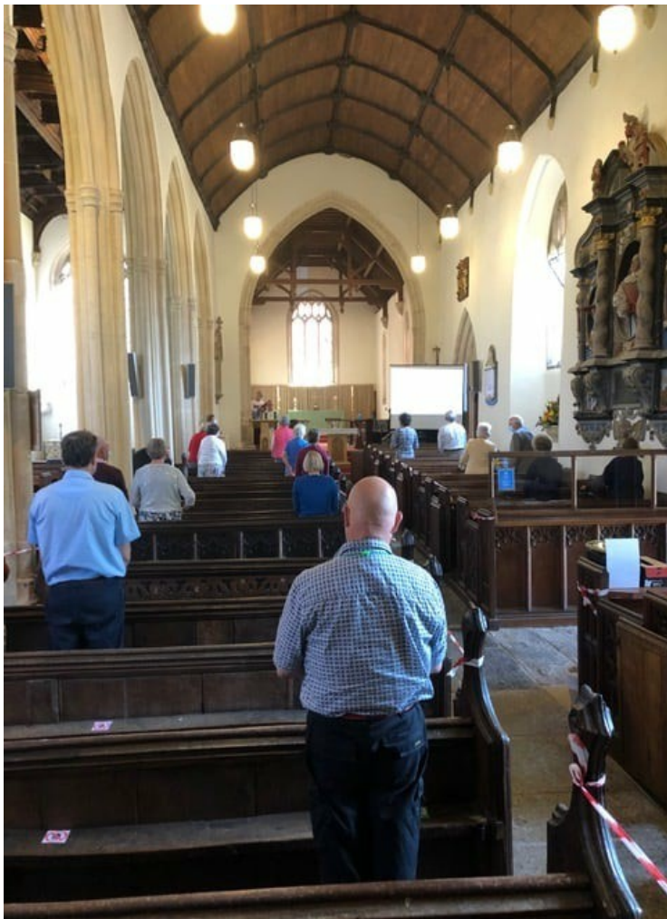
Socially Distanced Services in 2020